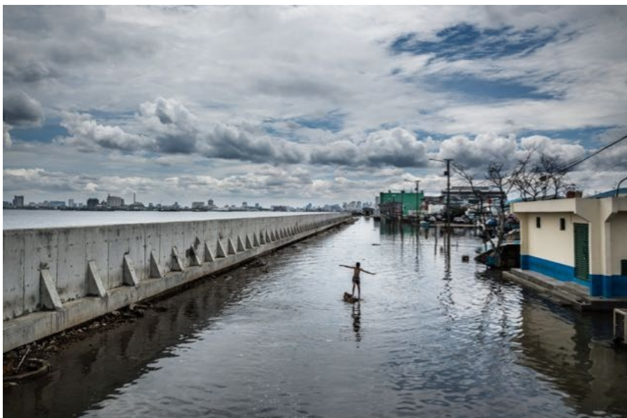
Title: Kadir van Lohuizen, Die neugebaute Ufermauer funktioniert nicht wirklich, Jakarta, Indonesien, 24. Dezember 2018