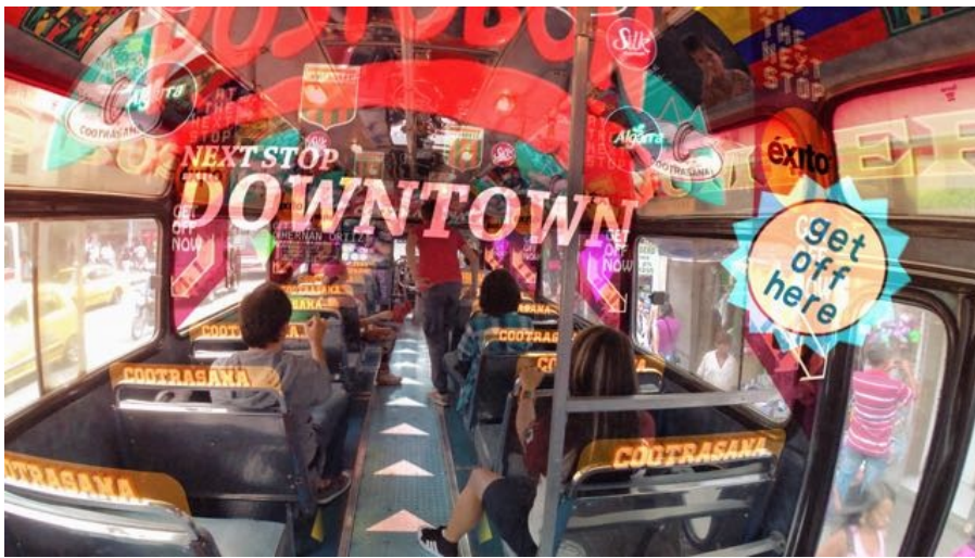
Title: Keiichi Matsuda, HYPER-REALITY, Film (Still), 2016 Fotocredits: Keiichi Matsuda Fileformat: .jpg Resolution: 3840 × 2160 Size: 2,5 KB